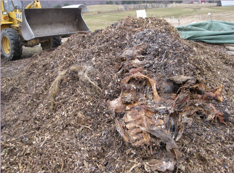
Figure 6-3. Compost pile opened after 4 months. Most of the soft tissue is gone, leaving some hide, hair and bones. The wood chips are dry on the outside having adsorbed and contained leachate and odors.

carcasses (e.g. birds and fish) and moderate carcasses (e.g. pigs, small deer and calves). However, a pile or bin cannot accommodate numerous layers of whole large carcasses, such as mature sows, cattle and horses. Larger animals are typically composted in a pile, windrow or bin with only one or two layers. As more animals are added, additional piles are started or the pile is expanded in length creating a windrow.