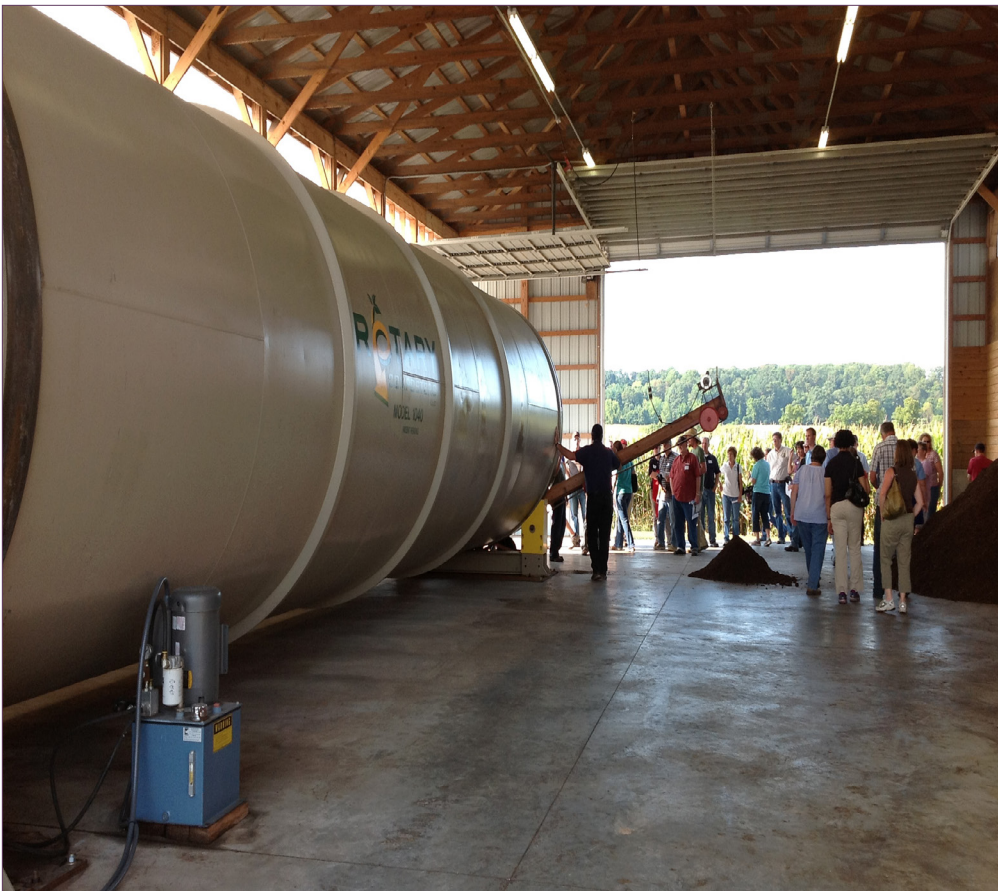
Figure 6-13. Rotating drum for carcass composting