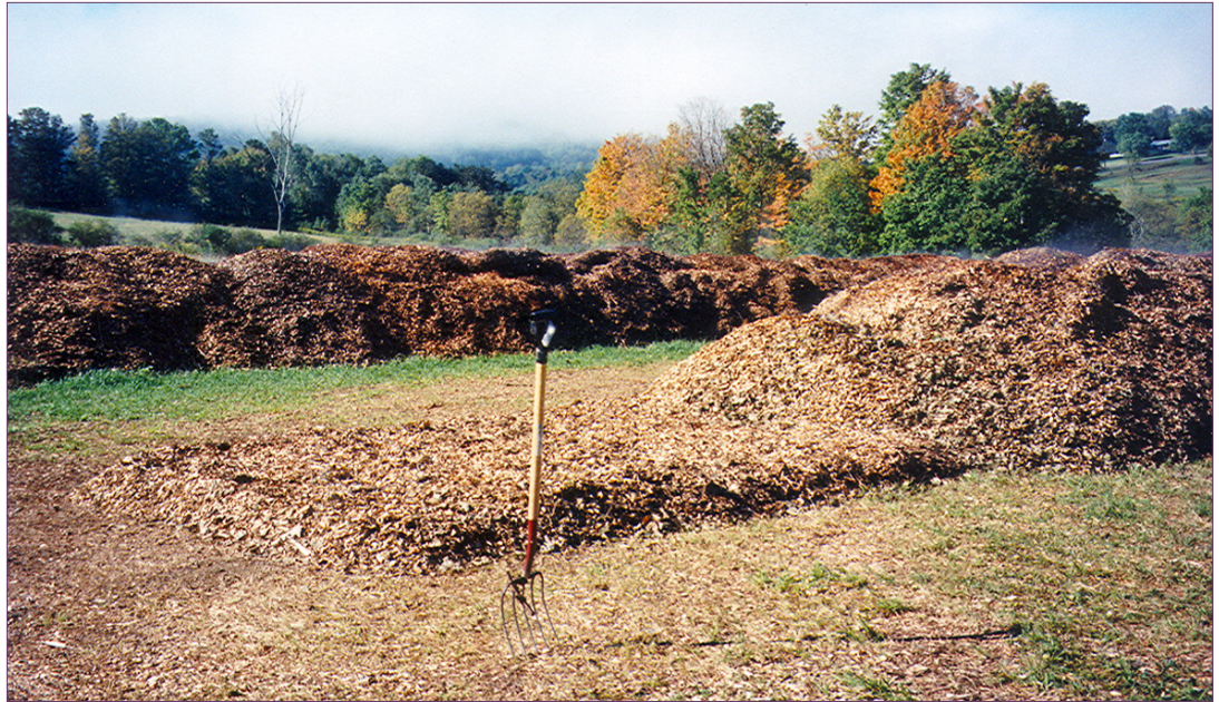
Figure 6-8. Static windrow composting with bed prepared for additional animals or butcher waste

weekly in layers, it is best to stair step the animals into the pile. Build the first end and extend a carbon bed out so that it is ready for additional animals. In the case of large animals, there is no middle layer, so this will be the final cover layer or biofilter and should be 24 inches (61 cm). When animals are added to the pile, dates should be recorded, especially the last one. If it is a windrow, dated flags can be placed in the pile to keep track; one end of a 100 foot (30 m) windrow will be finished before the other. Always make sure animals are well covered to avoid related problems (odor, vermin, etc.).