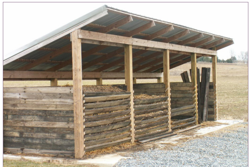
Figure 6-11. Example of a wooden bin used for poultry

Several common styles of mortality composting bins are available. The choice depends on factors that include the type of operation, animal species, regularity and