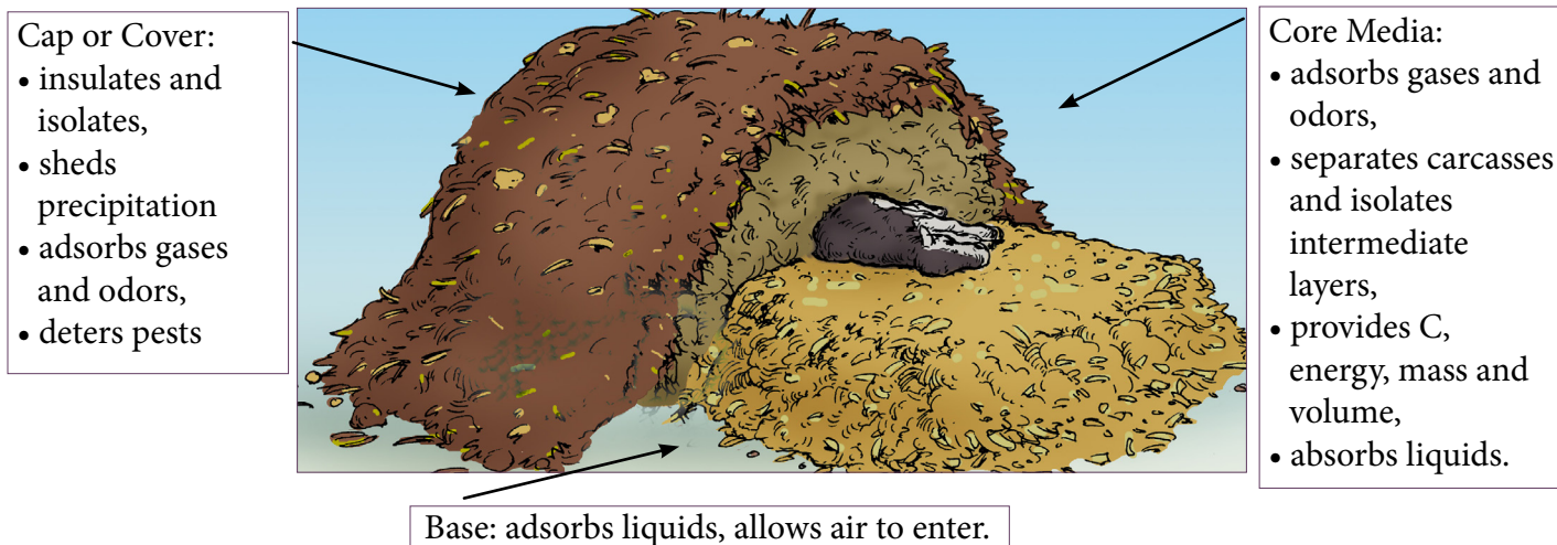
Figure 6-5. The functions of amendments in mortality composting

When considering amendments, it should be remembered that, “All amendments are not created equal.” For instance, particle size makes a difference: wood chips are larger and provide more porosity than shavings; and shavings provide more porosity than sawdust. In terms of degradability and the availability of carbon, sawdust would be best of the three choices and wood chips, the worst. However, wood chips are preferable because they give the pile the structure it needs to facilitate aeration. The condition of the amendment matters, perhaps more than the type of material. The moisture content, particle size, porosity, bulk density, C:N ratio and age can vary for almost any type of amendment. Wet sawdust does not absorb moisture as well as dry wood chips. Mature compost, aged manure and very old silage may not provide enough carbon or energy to sustain heating while