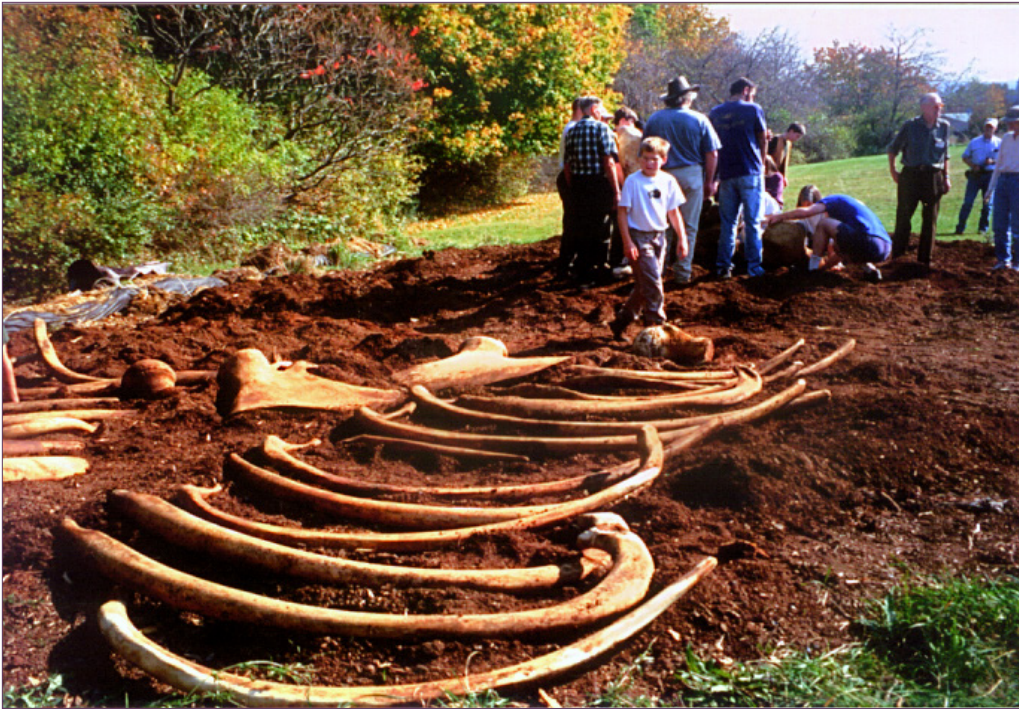
Figure 6-1. Whale bone remains following composting

and is biosecure. The temperatures achieved through the composting process may eliminate or greatly reduce pathogens, hindering the spread of disease. Research continues to demonstrate effective destruction of nearly all livestock diseases of concern. Properly composted material is environmentally safe and a useful soil amendment.