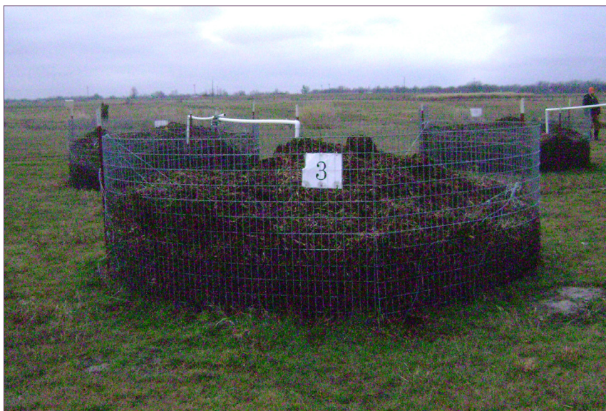
Figure 6-12. Wire bin mini-composter

Mini-composters represent a special application of passively aerated bins. They were developed for poultry but can be used for any small animals up to 30 lbs. (13.6 kg) including piglets, rabbits and fish. The beauty of mini-composters is that they can be located within the animal rearing areas and can be sized according to need.