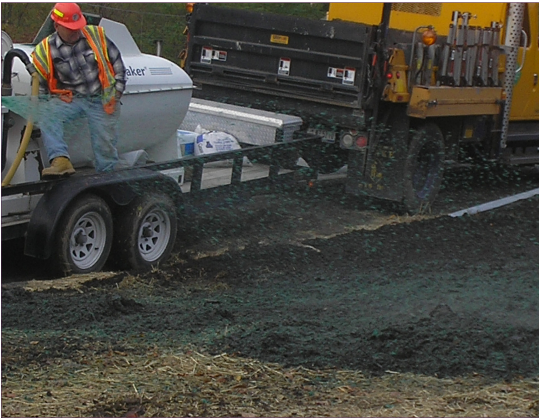
Figure 6-10. NYS Department of Transportation applying road kill compost along highway

compost undisturbed for roughly 2 weeks to 6 months, depending on the largest carcass size and management objectives. The pile/bin should be monitored for temperature, odors, and signs of scavengers, flies and leachate. Any problems that are detected should be corrected (Monitoring Compost Piles or Windrows). In the meantime, new piles or bins may be started to treat additional mortalities.