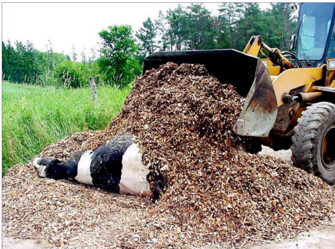
Figure 6-2. Enveloping a carcass with wood chips

Mortality composting methods evolved from the basic passively aerated pile or bin approach developed for composting poultry mortalities. With that approach, a number of carcasses are placed in a layer on a base of dry amendment and capped with more amendment. Layers are built upward in succession until the pile or bin reaches its desired maximum height (Figure 6-4). Layering predominates with small