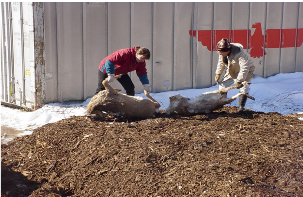
Figure 6-9. Deer carcasses placed on the base layer

4. Cap the pile or bin: The final layer of carcasses should be covered with a thicker layer of amendment. For small to moderate animals, 12 to 18 inches (30 to 45 cm) is typical. For large animals, 18 to 24 inches (45 to 60 cm) is necessary. The appearance of scavengers and flies means that the thickness should be increased. The same amendment used to cover intermediate layers can also be used for the final cap.